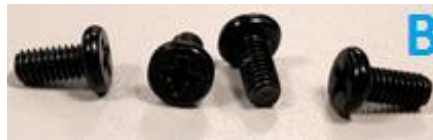
M4 head-BL screws Quantity: 4 Use: Securing bracket onto monitor