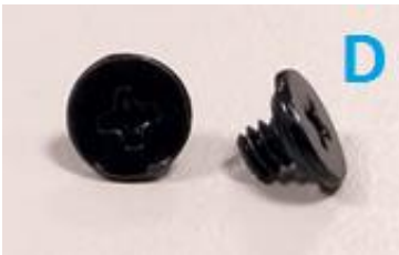
#6-32 Step Screw Quantity: 4 (Use 2) Use: Locking chassis onto bracket