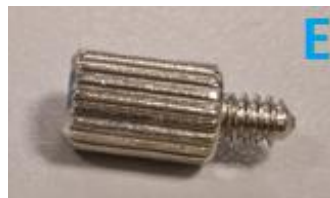
#6-32 Thumbscrew Quantity: 1 Use: Securing chassis onto bracket