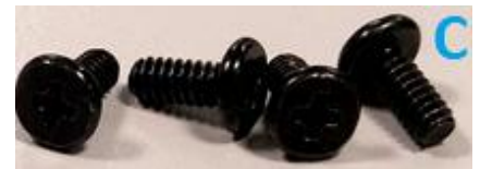
#6-32 head-BL screws Quantity: 4 Use: Fixing hinge to chassis