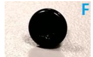
#6-32 Security Screw Quantity: 1 Use: Securing chassis onto bracket