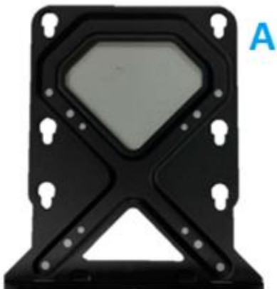
VESA Mounting Bracket (Genie Micro) Quantity: 1 Use: Fixing bracket to monitor

PARSGMP2 - VESA Mounting Screw Pack for Genie Micro (AV'16)