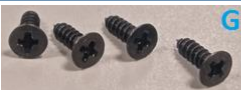
Tapping Screw Quantity: 4 DO NOT USE